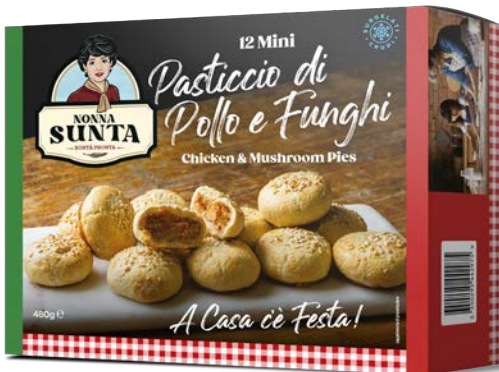
CHICKEN & MUSHROOM PIES