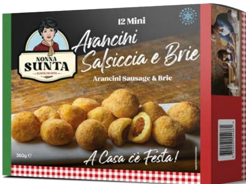
ARANCINI SAUSAGE & BRIE